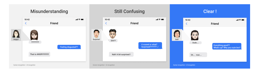
Fig. 1. Users tend to express emotion with Memoji and It can lead the communication mood; misunderstanding, confusing and clear

MINJUNG PARK, Color Lab, Department of Industrial Design, KAIST, South Korea HYEON-JEONG SUK, Color Lab, Department of Industrial Design, KAIST, South Korea